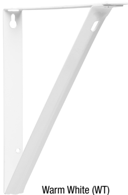
Warm White (WT)